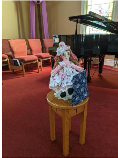
On Sunday, March 7th, we celebrated Women's History Month with flowers and mentioned each of the women that passed this year.