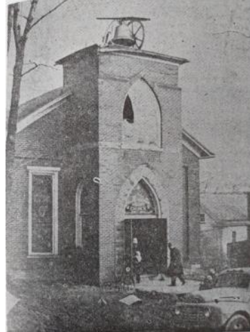
Steeple damage after Nov. 25, 1950 Hurricane – bell & wheel are visible

The Upper Mount Bethel and Portland churches merged in 1963 to form the Community Presbyterian Church of Mount Bethel and Portland and four decades after the merger, the Portland church was sold. The bell was removed from the tower and stored for a time at the farm of member Paul Raesly until the new church was completed in 2006. The bell was then moved to the site of the new church on route 611 and now stands on a pedestal in front of the church. The original steel support stand has been refurbished by a team of volunteers.